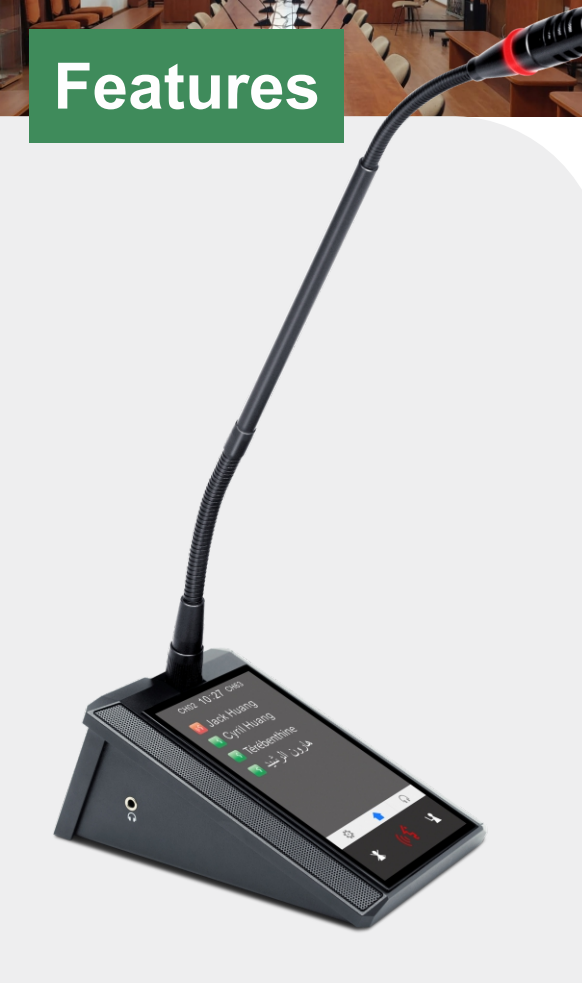
VIS-DMD-T Multi-Media Digital Conference Unit with Touch Screen