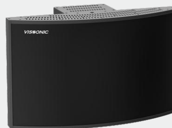
VIS-VLI701B Digital IR Infrared Radiation Unit