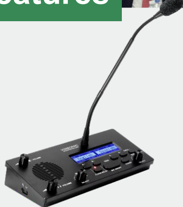
VIS-INT64 64 Channels Interpreter Desk