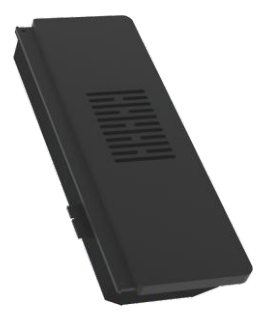
VIS-MSPK Speaker module