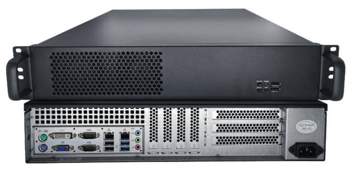
VIS-Server-E2 paperless management server