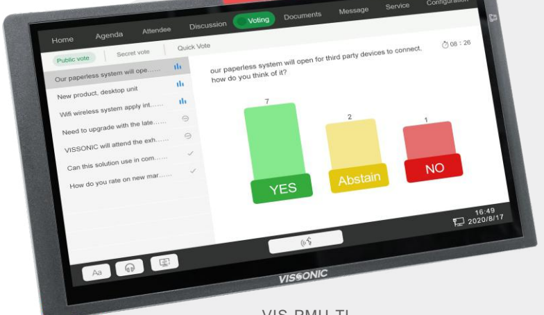
VIS-PMU-TL Desktop 15.6" paperless conference terminal