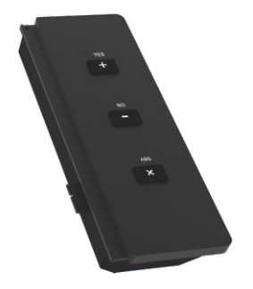
VIS-MVOT Voting module