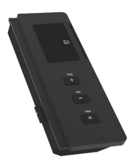
VIS-MVIC Voting + IC card reading module