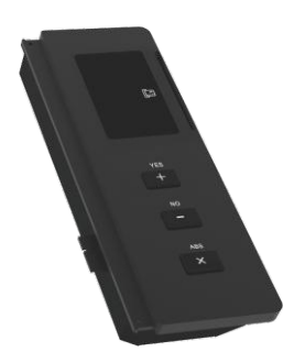
VIS-MVIC Voting + IC card reading module