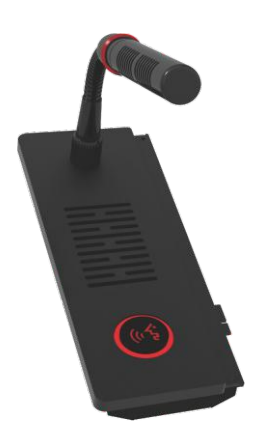
VIS-MDSP Discussion + speaker module